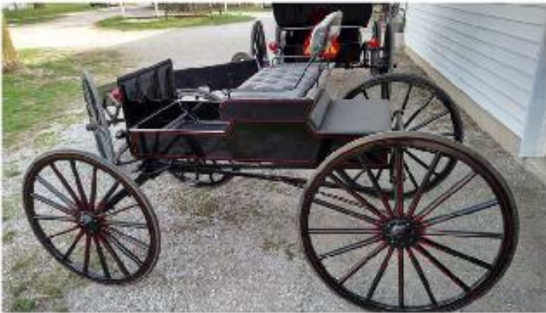
New Amish made pony runabout with shafts and trunk with functioning lid. $2000.00