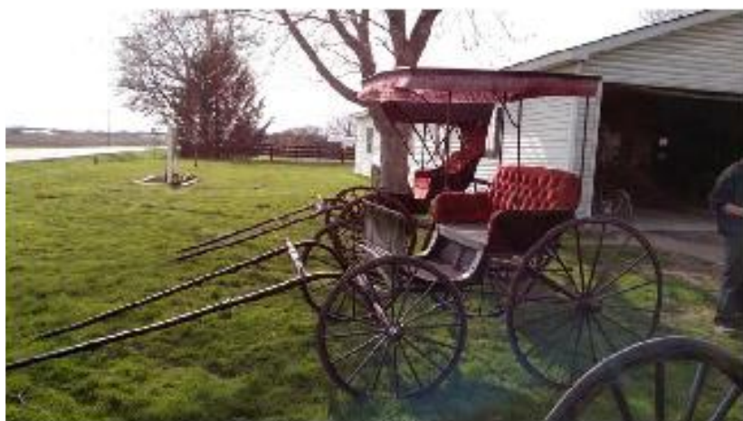
1870-1910 Lady's Phaeton with older restoration. $1995.00