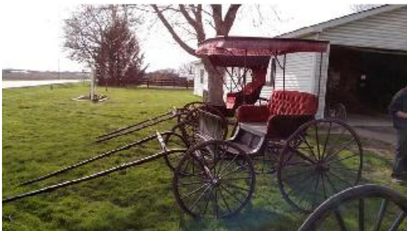
1870-1910 Lady's Phaeton with older restoration. $1995.00