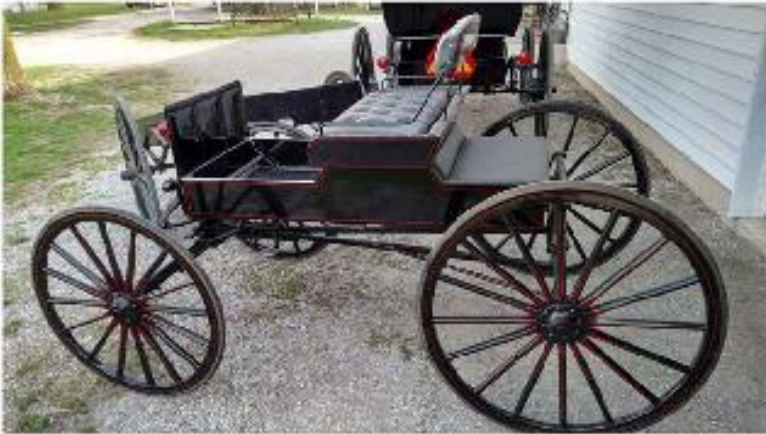
New Amish made pony runabout with shafts and trunk with functioning lid. $2000.00