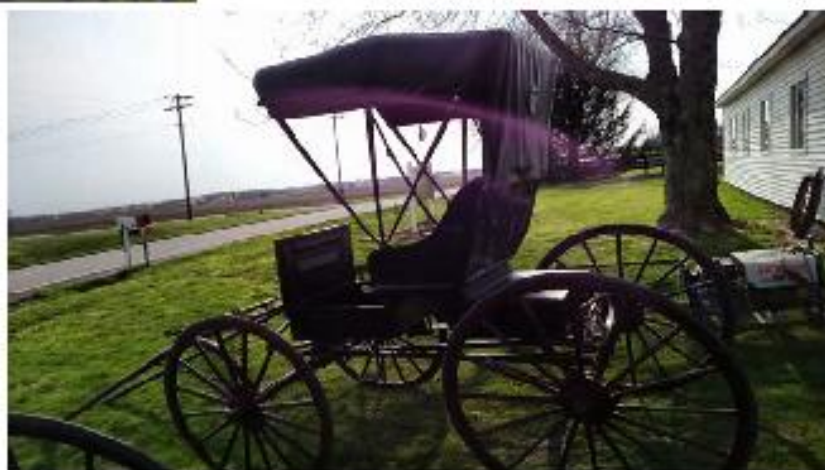
13 year old Doctor's buggy with brakes and cut under for $2500.00.