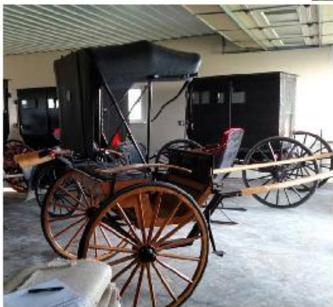
EZ Entry two wheel cart with canopy. $2600.00

Also available: RockHome Gardens People Mover $2795.00. Reproduction Vis a Vis $5000.00. New Pony Cart $2000.00. Also taking orders on new two seater open carriages $5000.00. Contact Darla Finley for more information: 217-841-4664 or mucksforbucks@yahoo.com