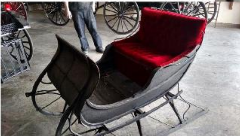
Multiple sleighs available. $995.00 each "as is" or call for pricing if you would like one restored.