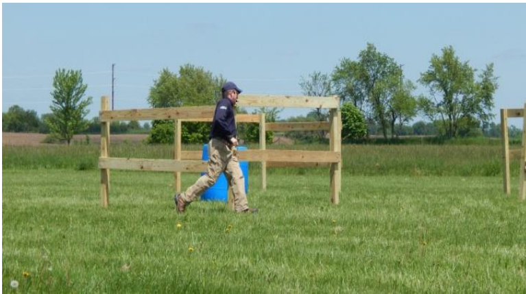
Sterling trots a line into the Four Corners obstacle (forward, round, and with bend!)

clear.” Not only did he drive most of the horses (including Newman!), he also personally walked the lines he wanted us to drive – even bravely walking with us following right behind him! – and also used himself as a human “cone” when drivers were cutting corners or turning too early or late quipping “I’ll help you.”