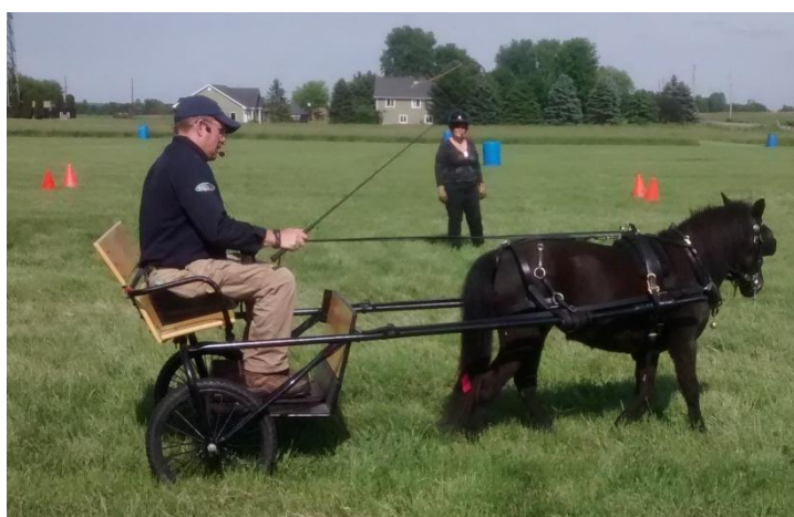
Sterling driving "Starlane Rhona"