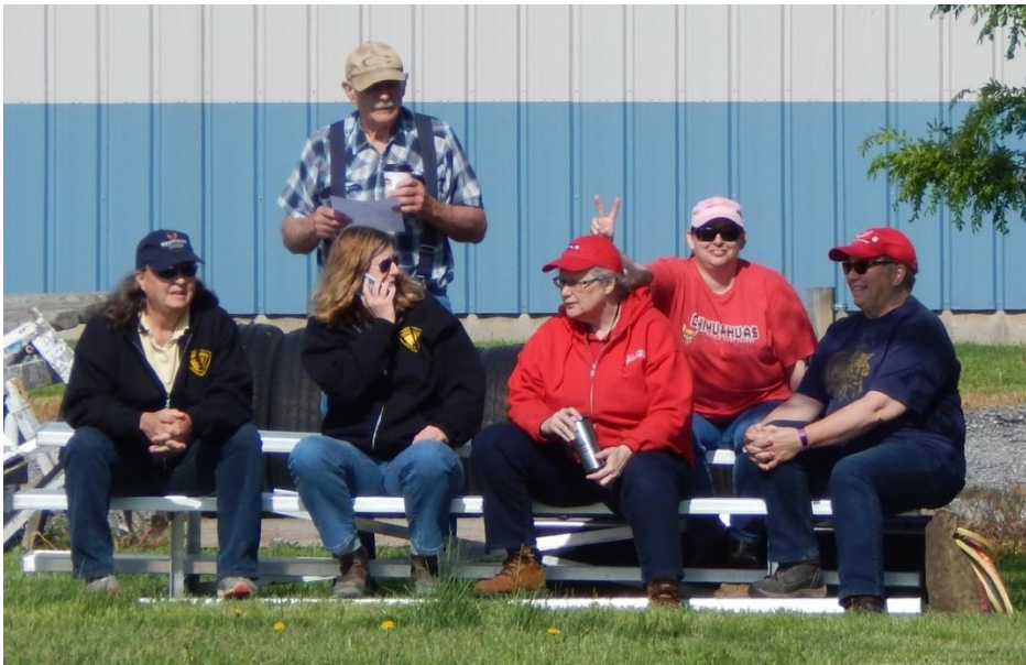
Group of auditors by the cones course